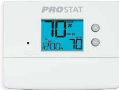
PRS4110 – PRS4210 Programmable Thermostat