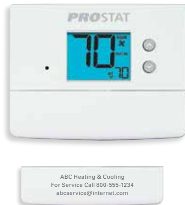
Permanent pad printing on removable thermostat doors