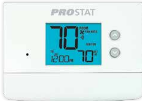
PRS7325WF Universal Smart WiFi