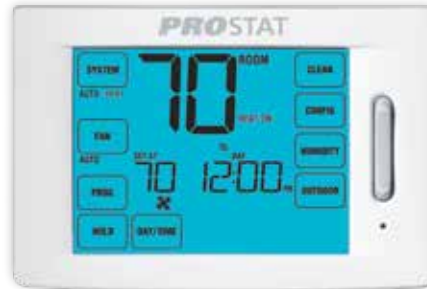
PRS6420 Premier Universal Programmable Touchscreen Thermostat