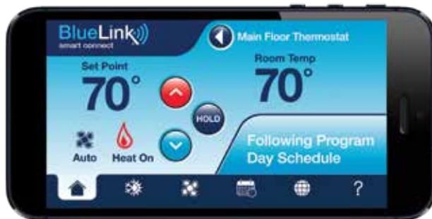
BlueLink® Smart Connect Application