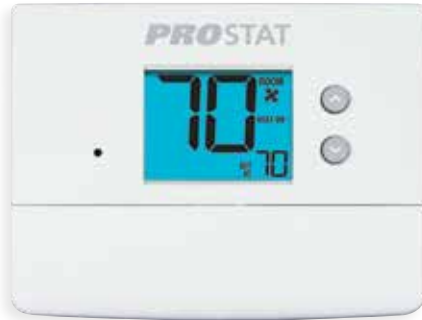
PRS3110 – PRS3210 Non-Programmable Thermostat