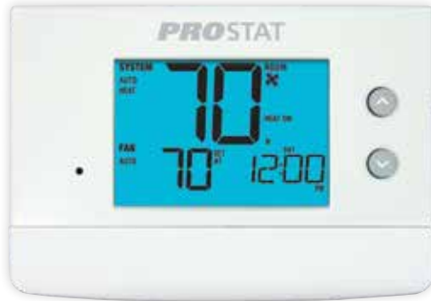
PRS6110 – PRS6210 Premier Universal Programmable Thermostat