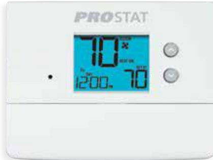
PRS4110 – PRS4210 Programmable Thermostat